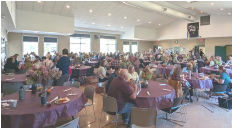
Luncheon @ LWLHS